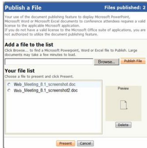
Figure F. Document Publishing "Publish a File" Window